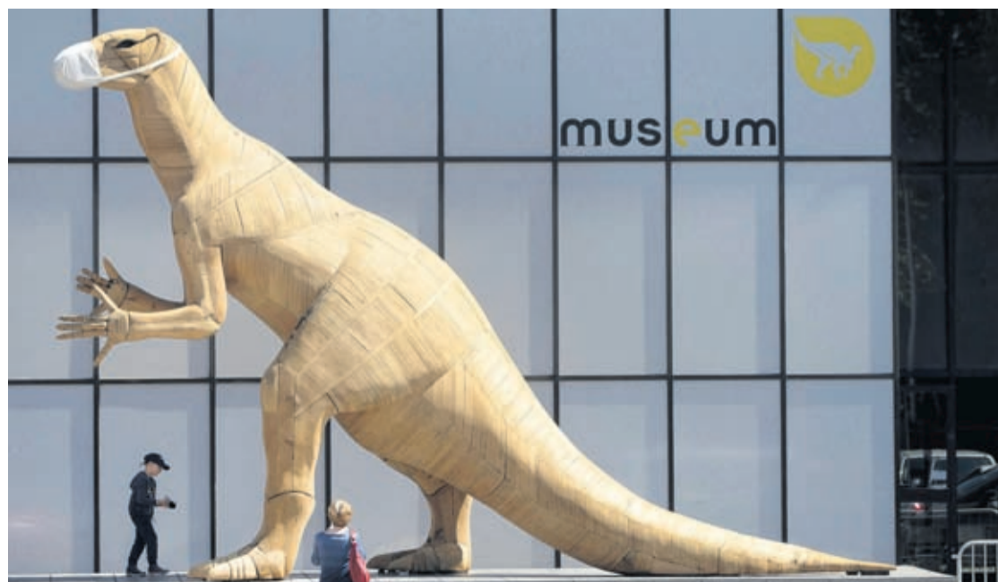
A boy walks by a model of a dinosaur wearing a face mask, during a partial lockdown to prevent the spread of the coronavirus, at the Museum of Natural History in Brussels, Tuesday, May 19, 2020.